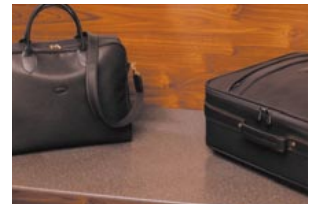
LUGGAGE RACK IN CORIAN® CANYON.