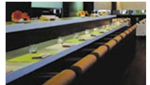
SIDE HOTEL, HAMBURG, GERMANY. DESIGN MATTEO THUN AND BOB WILSON. DETAIL OF SUSHI BAR COUNTER IN CORIAN® SEAGRASS.